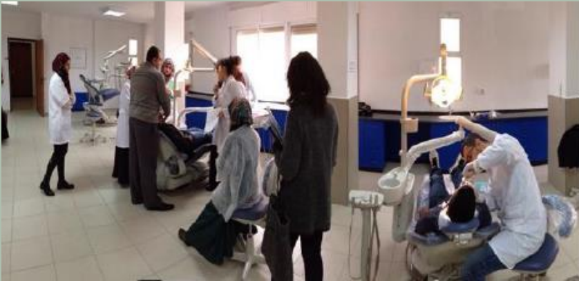
Dental Faculty and Students in the new Dental Building