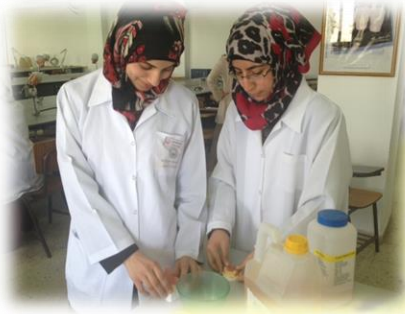
Dental Students of Al-Quds University

This donation provided six Midmark dental chairs, dentist's stools, fiber optic handpiece tubing, and other vital needs for dental students to learn their trade.